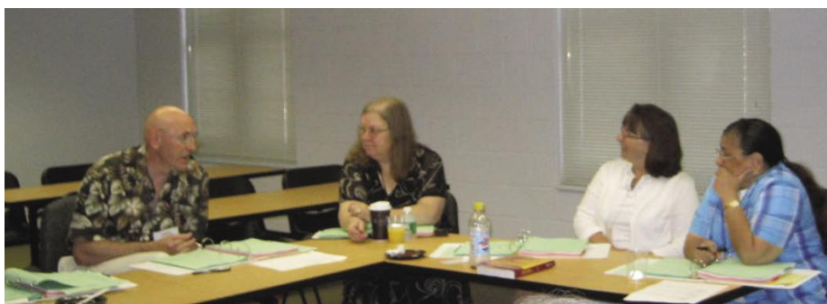
From 13 states, nursing educators gathered on campus for the fifth annual Faculty Development Institute, co-sponsored by the College of Nursing and the National League for Nursing.

The sixth annual Faculty Development Institute will be held June 3-8, 2006. Housing is provided on campus. For more information, visit: www.villanova.edu/nursing/ce/conferences or call (610) 519-4930.